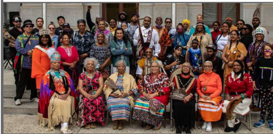
Photo from the City of Philadelphia Mayor's Office from the celebration of Indigenous People's Day 2021

Whose Land - Family Action Toolkit - Queer Inclusive Books Celebrating Indigenous Cultures