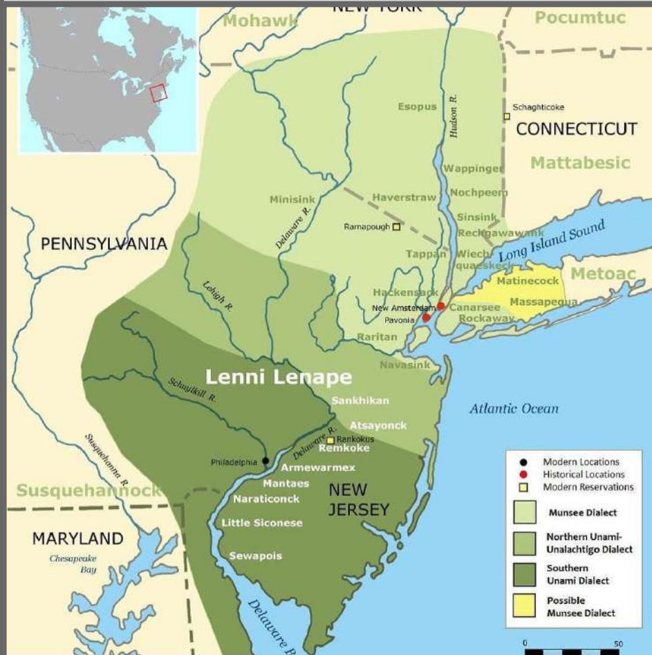
Map of Lenape languages and tribes.